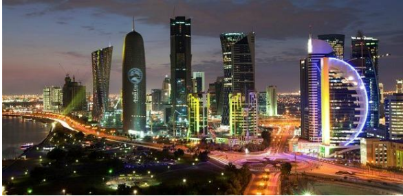
The Doha, Qatar skyline

FCIA's Qatar Members look forward to a FCIA Educational Symposium in Doha March 27. FCIA's Firestop Education, followed by FM 4991 and UL Qualified Firestop Contractor Exams, take place March 28.