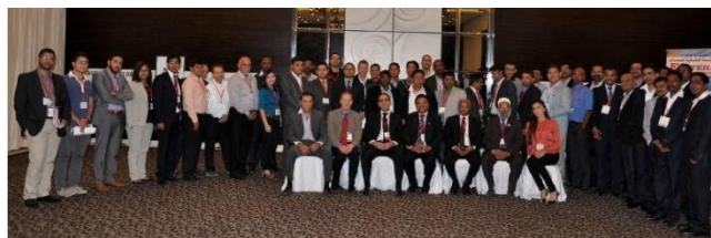
Attendees at 2012 Dubai, UAE FCIA DIIM Educational Symposium

FCIA visits Abu Dhabi again March 24 at The Yas Hotel. We look forward to presenting new firestopping and effective compartmentation information to the FCIA Membership and Departments of Civil Defence, Municipal Affairs and other consultants and design professionals. FCIA, FM & UL Firestop Education, FM 4991 Approved and UL Qualified Firestop Contractor Exams take place March 25.