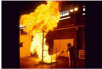
Test being conducted in one of the facilities in the Burn Hall

Join FCIA in Ottawa, Ontario, September 9-11 for FM and UL/ULC Firestop Exams , FCIA Education, Industry Education and a tour of the National Research Council of Canada's (NRC) full-scale test Facility in Almonte, Ontario . There are only two of these size facilities in the world: China and Almonte. You don't want to miss this exciting opportunity to see this awe-inspiring operation.