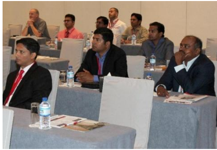
Attendees at the Abu Dhabi Symposium

way both membership and the firestopping industry have evolved through the DIIM, DIMM, in this part of the world.