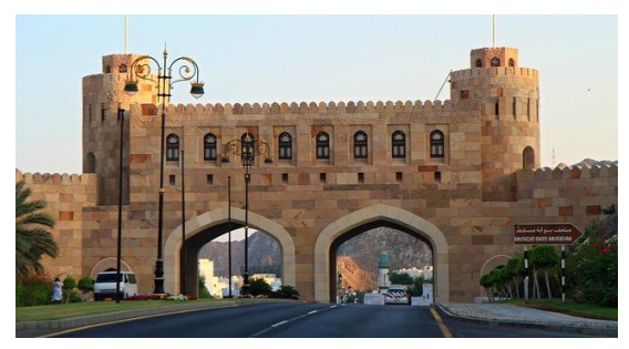
The Muscat Gate Museum

On April 2 & 3, FCIA speaks at a Fire Safe Oman Educational conference. <u>Click here</u> for more information about the event.