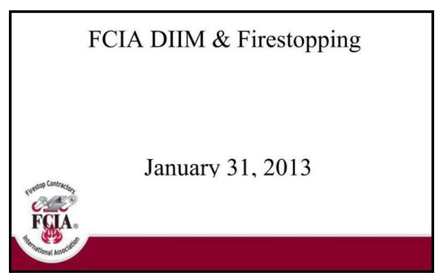
Miss the last webinar? Click the image above to see slides from that presentation!

At FCIA, there's a lot of value in membership built in. Take advantage and realize the benefits that come with your $1225 investment in Annual Membership Dues by visiting FCIA.org, Members Only, attending webinars for free, enjoying Life Safety Digest, the magazine of effective compartmentation, attending conferences, and more. Look for the webinars to cover much more in 2013.