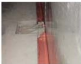
Perimeter Curtain Wall