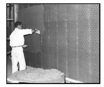
Fire Rated Walls