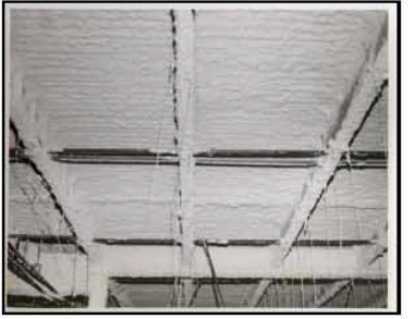
A Great Finished Deck