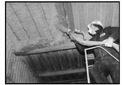
Applying the Proper Thickness

Call us for information about today's fireproofing and plastering systems and the best people to apply them.