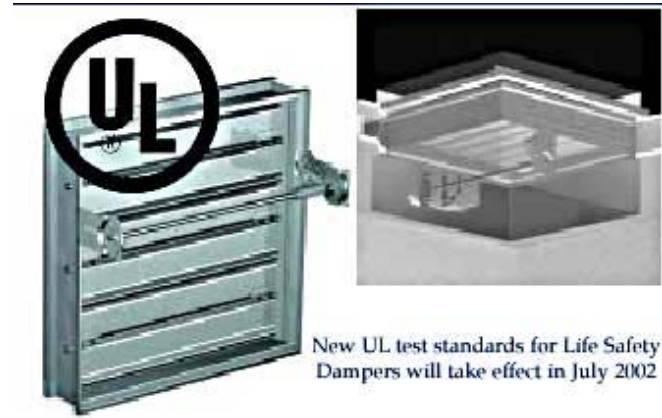
New UL test standards for Life Safety Dampers will take effect in July 2002