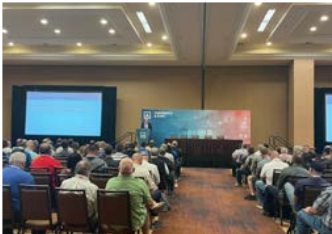
Bill McHugh presents to a packed room at NFPA's Conference this June.

That started the hour-long conversation on maintaining protection of fire-resistance in existing buildings. Special emphasis was added to point out that the International Fire Code demands a fire-resistance inventory, and NFPA 101, NFPA 1, and other worldwide Fire Codes require maintaining continuous fire-