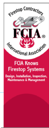
New Trade Show Display Panel

~FCIA at ASTM - New standards are being worked on and published at ASTM. FCIA continues to chair the ASTM E 2174 & ASTM E 2393 Standards, and is attending the April ASTM E 06 Meetings. We’ll be discussing an update change to remove a non-mandatory language in one of the standards. Plus, we’ll be working with ASTM Members on an ‘installation guide’, a very short document that addresses proper design and installation of firestop systems.