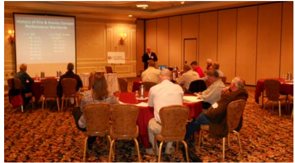
FCIA Members at Life Safety Organization Strategic Planning

Compartmentation, Fireproofing, Firestop Systems, Fire Dampers, Fire Rated Glazing, Rolling and Swinging Fire Doors and Hardware, plus more are promoted holistically. The next meeting is scheduled for April 26, in New Orleans.