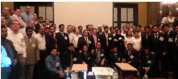
FCIA Educational Seminar, Abu Dhabi, UAE

We are grateful to the FCIA for coming and raising awareness of FCIA’s DIIM Process.”