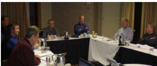
FCIA 2008 Board at Board Meeting, Phoenix, AZ

There is now a dedicated Apprenticeship Committee. The Education Committee program development was reassigned to the Technical Committee, the heart of knowledge for education programs. Marketing and Education will promote education programs forming relationships with important groups to promote the Specialty Firestop Contractor concept while recognizing manufacturer and associate members.